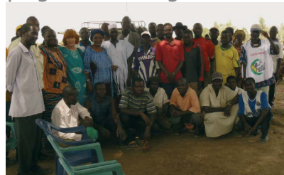
Meeting of the multipliers from Bangr Nooma, Burkina Faso