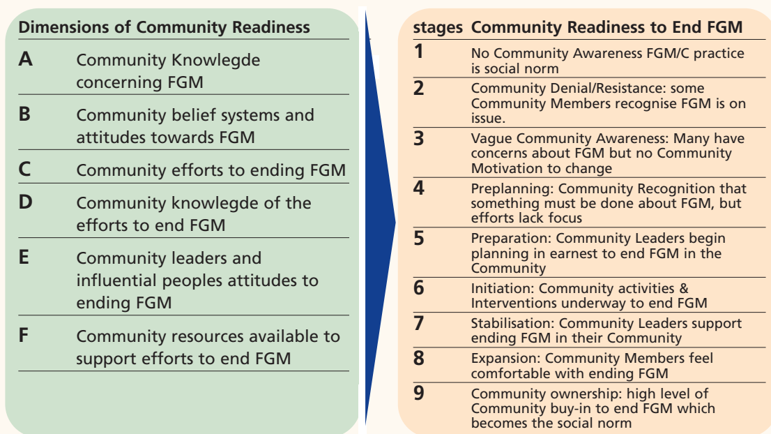
Figure 1: Dimensions of Change and Stages of Readiness to Change

The REPLACE Community Readiness to end FGM Assessment is multi-dimensional assessing six dimensions of change which are scored and then equated to one of nine stages of readiness to change. These are shown in Figure 1.